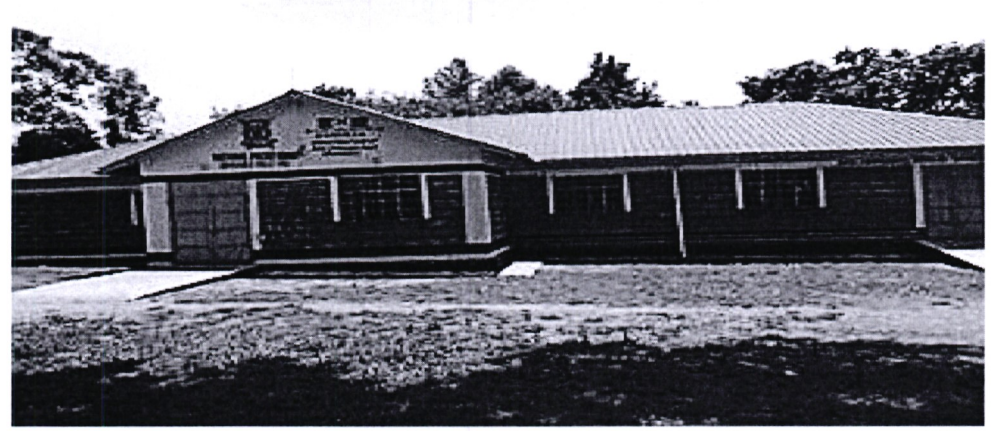
LWANDANYI ACC OFFICE & POLICE POST FY 2019/20