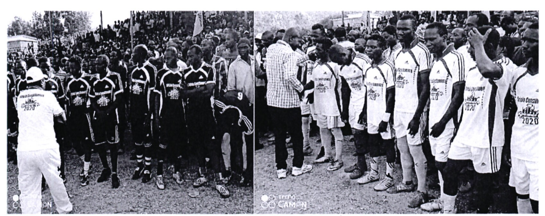
SIRISIA NG CDFC SPORTS TOURNAMENT YR 2020/2021

However, the implementation of such projects has not gone without challenges;