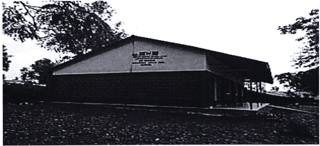
BUKOKHOLO GIRLS SEC. SCHOOL - CONSTRUCTION OF ONE CLASSROOM

The following are some of the success stories;