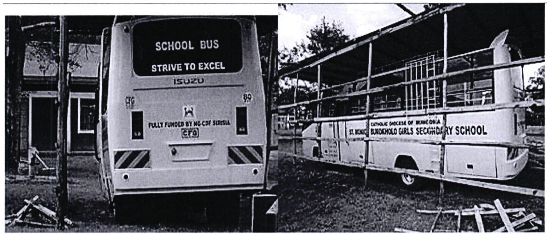
BUKOKHOLO GIRLS SEC. SCH – PURCHASE OF 51 SEATTER BUS FY 2020/21