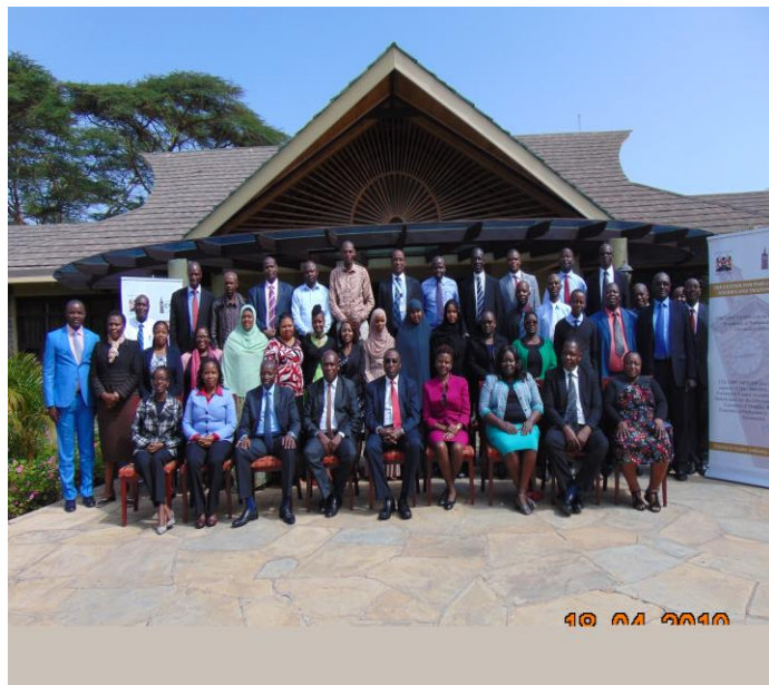
Course II content developers who attended the workshop in Naivasha