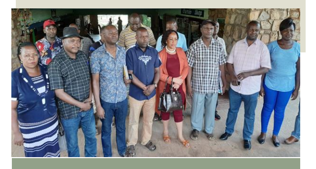
Part of participants from Taita Taveta County who attended training on effective management of Committee

It is the hope of the CPST that Taita Taveta County Assembly will implement these resolutions in order to better serve the people of Taita Taveta County through a vibrant Committee system.