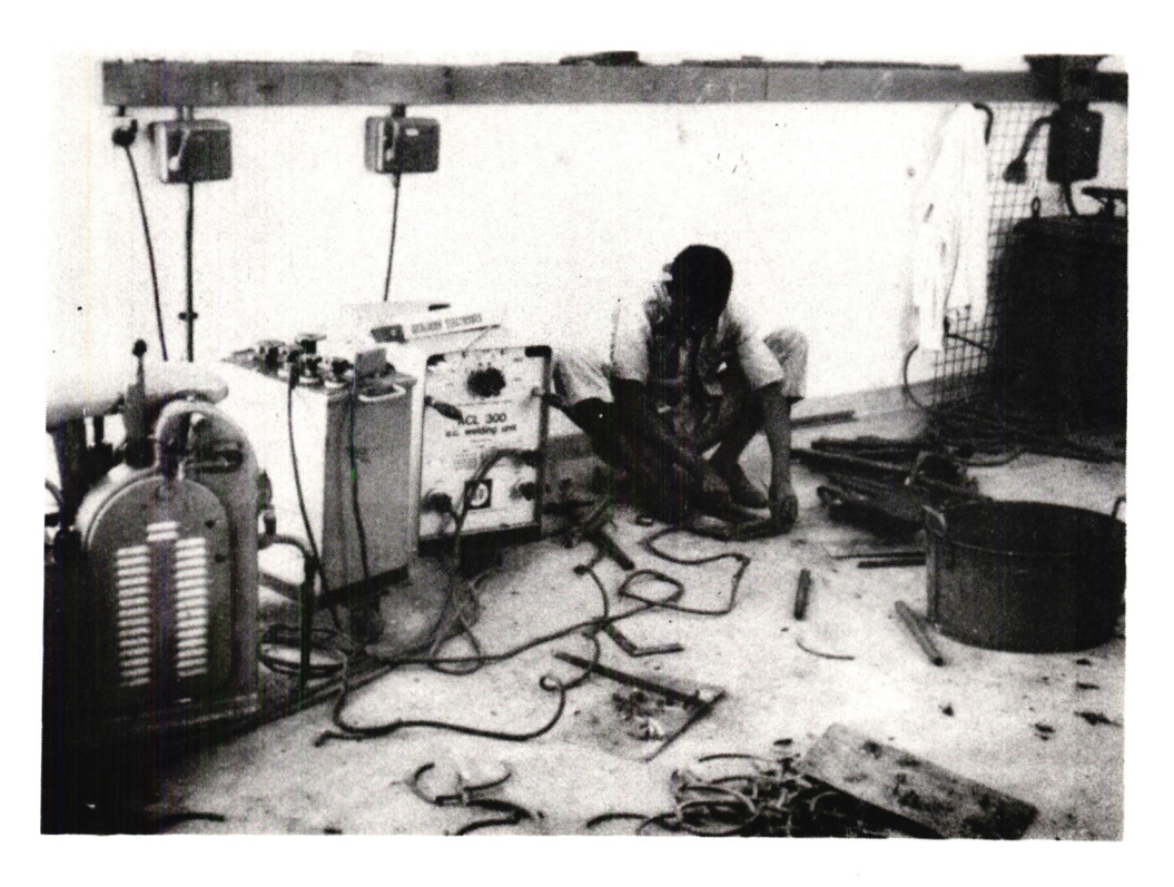
A Client at work.