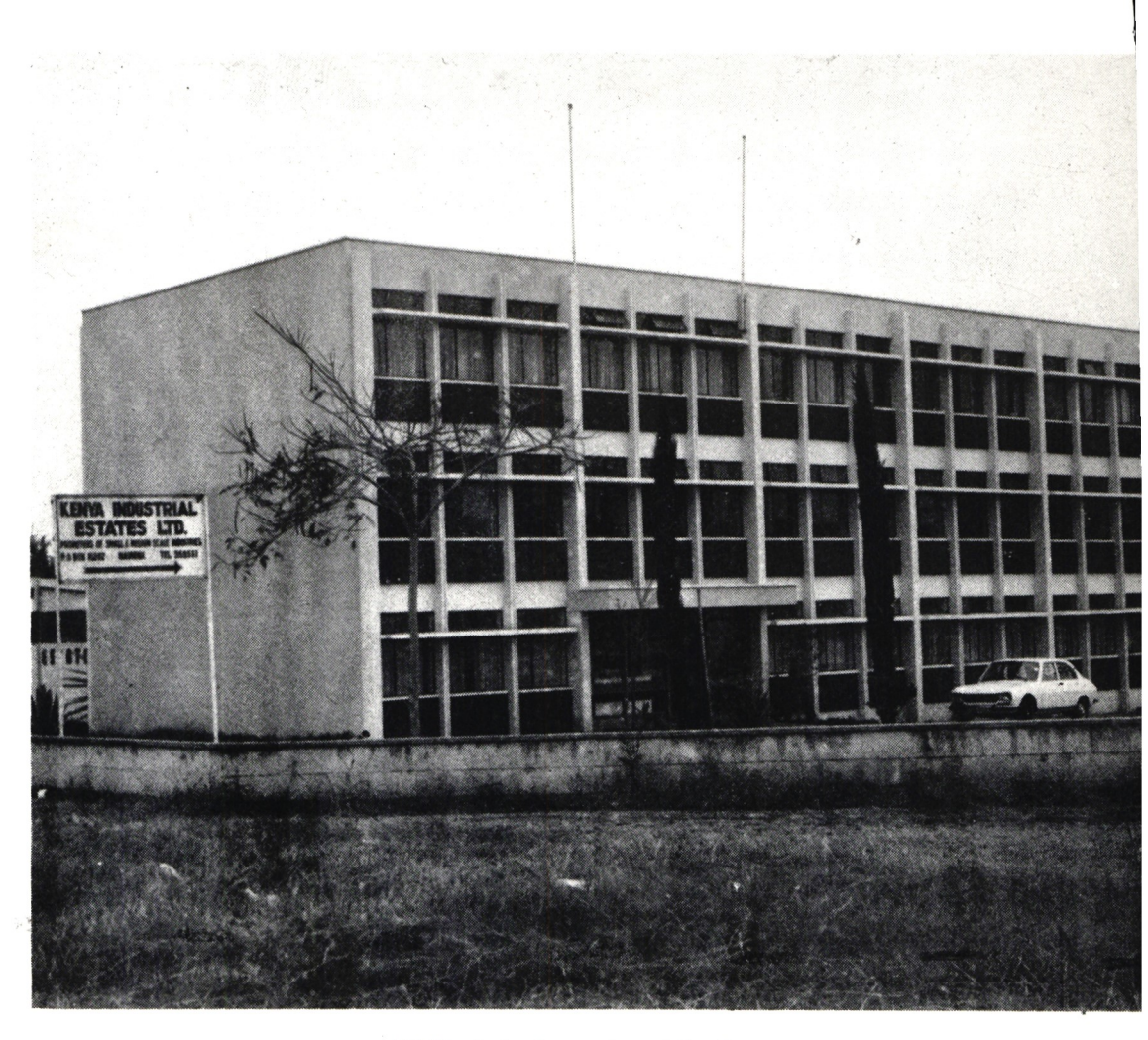
KIE Admistration block.