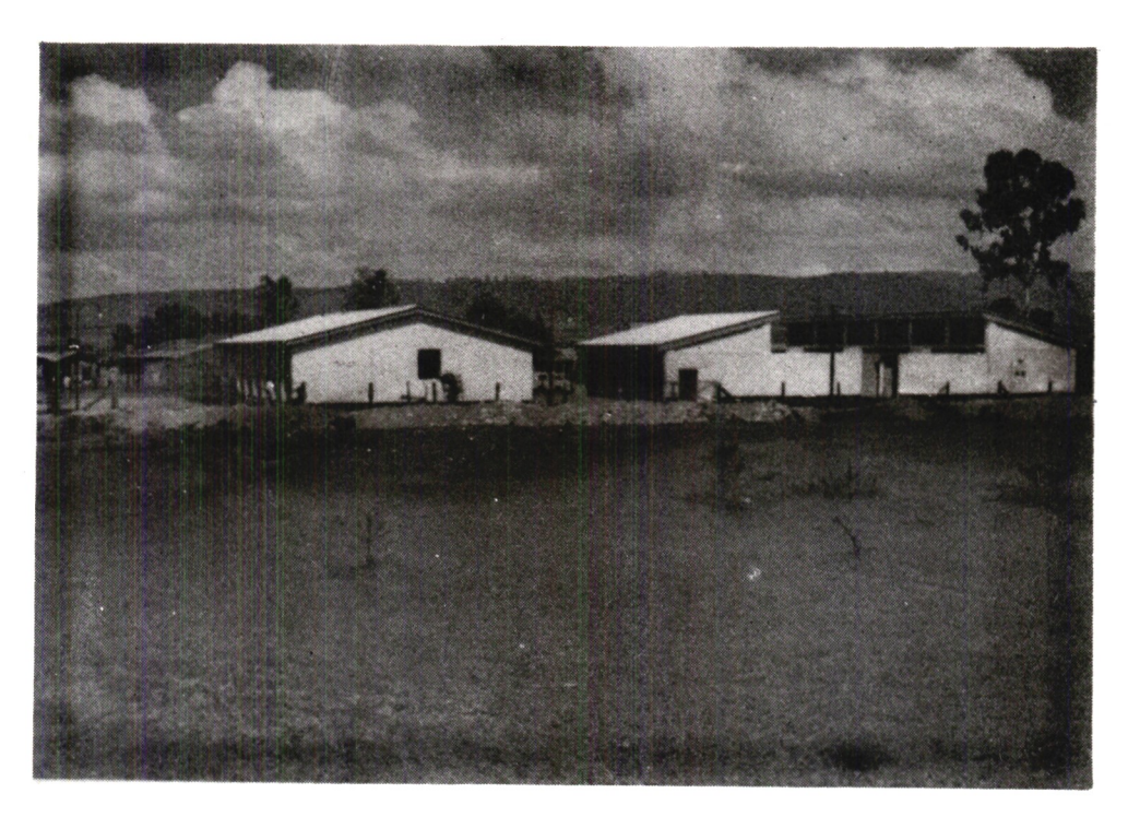
One of the Rural Industrial Development Centres.