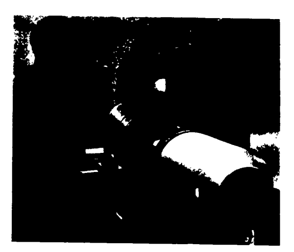
Milk Churn Factory at Nakuru