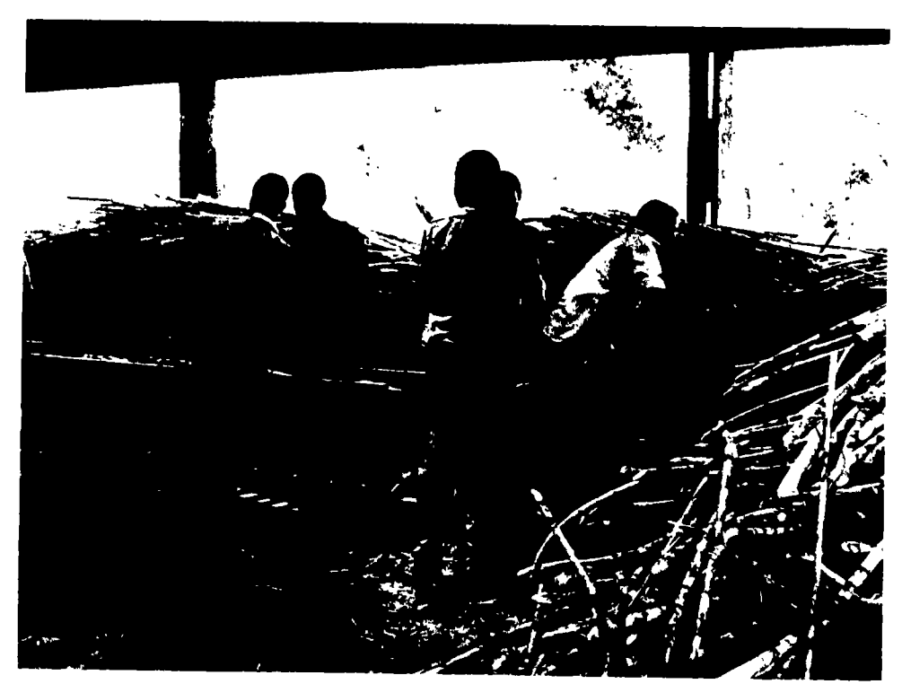
Inside Kabras Sugar Factory at R.I.D.C., Kakamega.