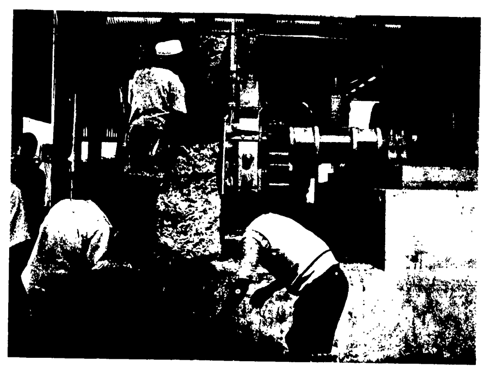
Inside Kabras Sugar Factory at R.I.D.C., Kakamega.