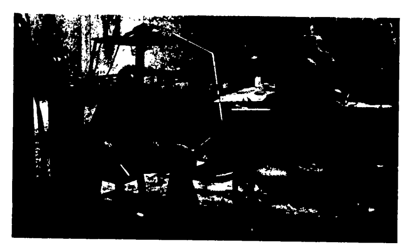
Farm Implement Factory at Nakuru