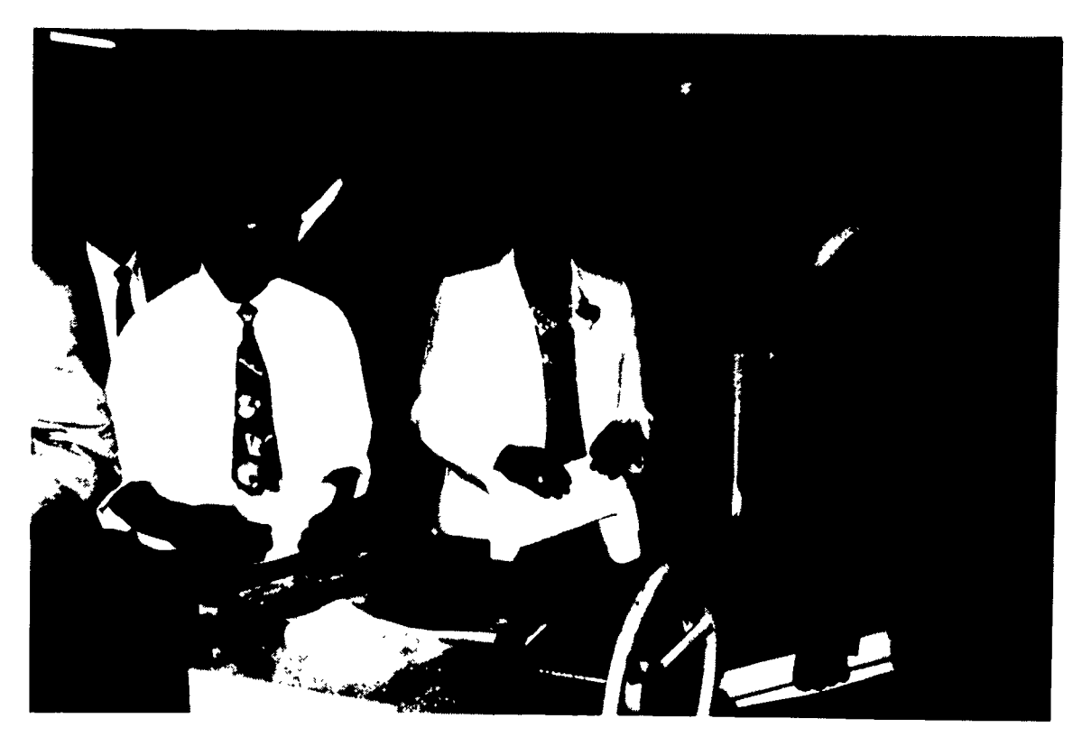
Demonstration of Binding system newly introduced to save the cost of repairing books