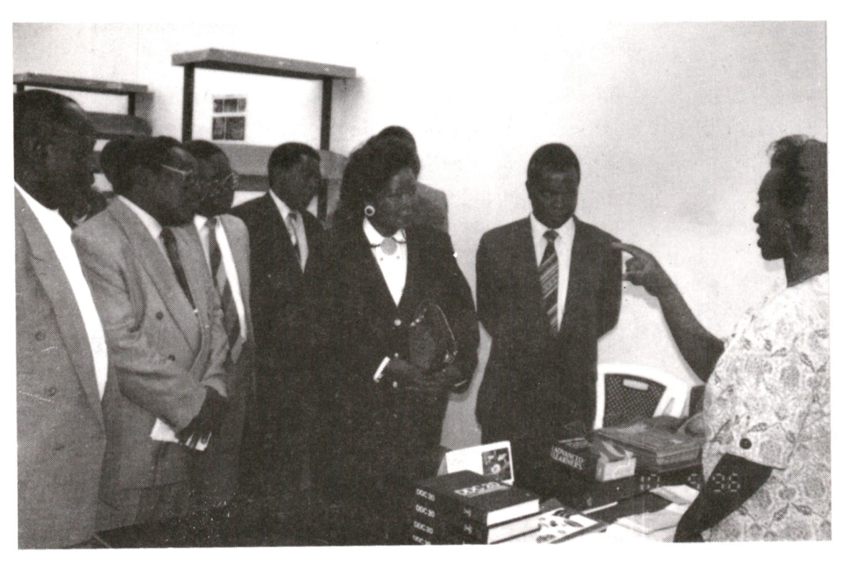
Hon N. K. Mwendwa (Minister for Culture & Social Services on her official visit to KNLS Nairobi Hqs.