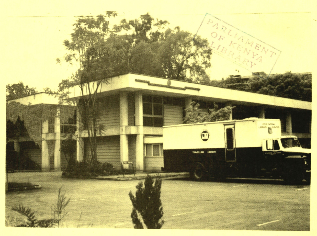
HEAD OFFICE, NGONG ROAD NAIROBI

P.O. BOX 30573 TELEPHONE 725550 FAX 721749 CABLE KENLIB NAIROBI KENYA