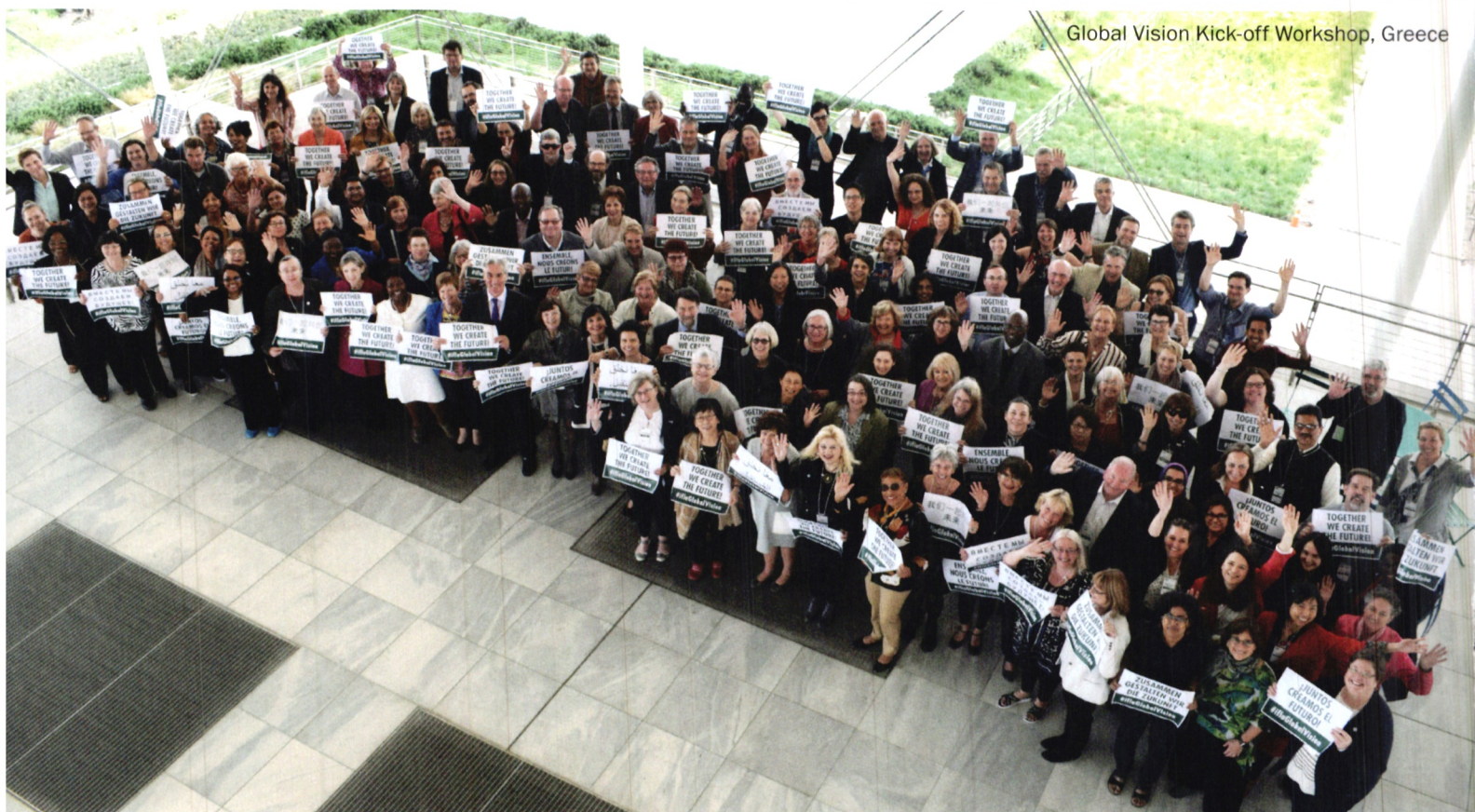
Global Vision Kick-off Workshop, Greece

As IFLA celebrated its 90th birthday, we saw the first results of the Legacy Partnership signed with the Bill and Melinda Gates Foundation, alongside the Public Library Association (PLA) and the Technology and Social Change Group at the University of Washington (TASCHA). The Partnership opens up an exciting new phase in IFLA's history – the highlights of which are in the following pages. It has also seen the first ever IFLA membership survey, whose results will be made available in the course of 2018.