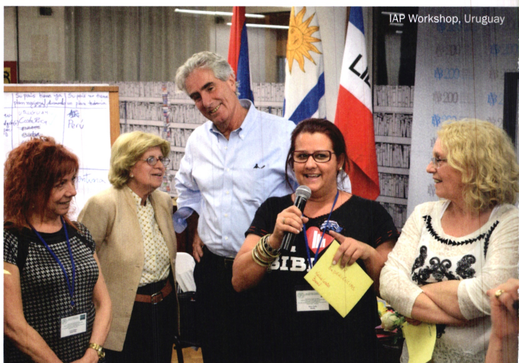
IAP Workshop, Uruguay