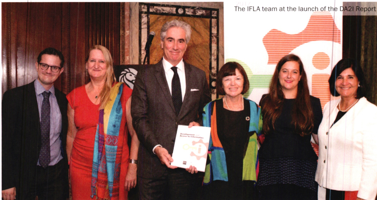
2017 The IFLA team at the launch of the DA2I Report

IFLA launched the first DA2I Report in 2017, providing quantitative and qualitative evidence of the importance of access to information for the achievement of the UN Sustainable Development Goals (SDGs).