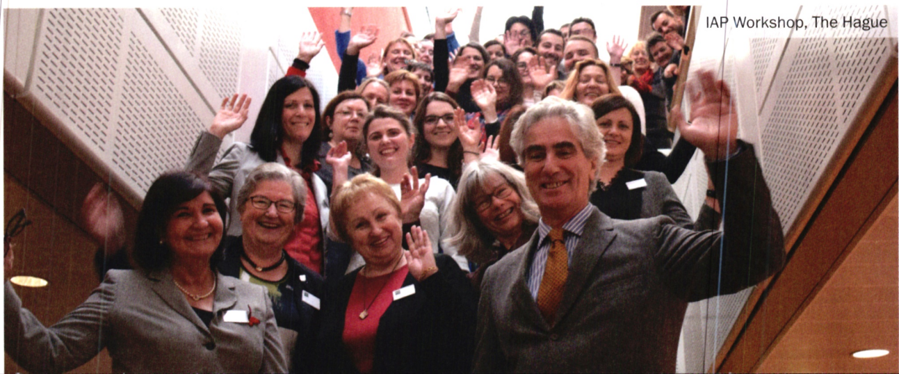
IAP Workshop, The Hague

Building on an evaluation in 2016, which showed the value to IFLA’s members of the Building Strong Library Associations initiative, a call for proposals was issued in February 2017. From 21 submissions, ten were selected for funding, with reports posted on the Library Development Programme webpages. Thanks to existing training materials and ongoing support from IFLA Headquarters, many others around the world have been able to consolidate or expand the activities of their association, with public libraries benefitting particularly.