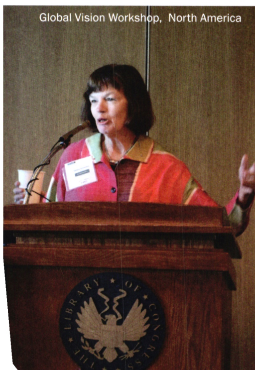
Global Vision Workshop, North America