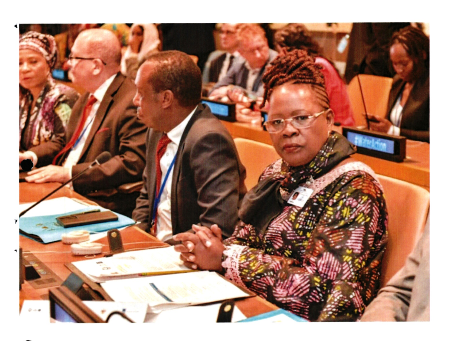
Water CS Hon. Alice Wahome takes part at the ongoing United Nations Water Conference that started on March 22-24th in New York