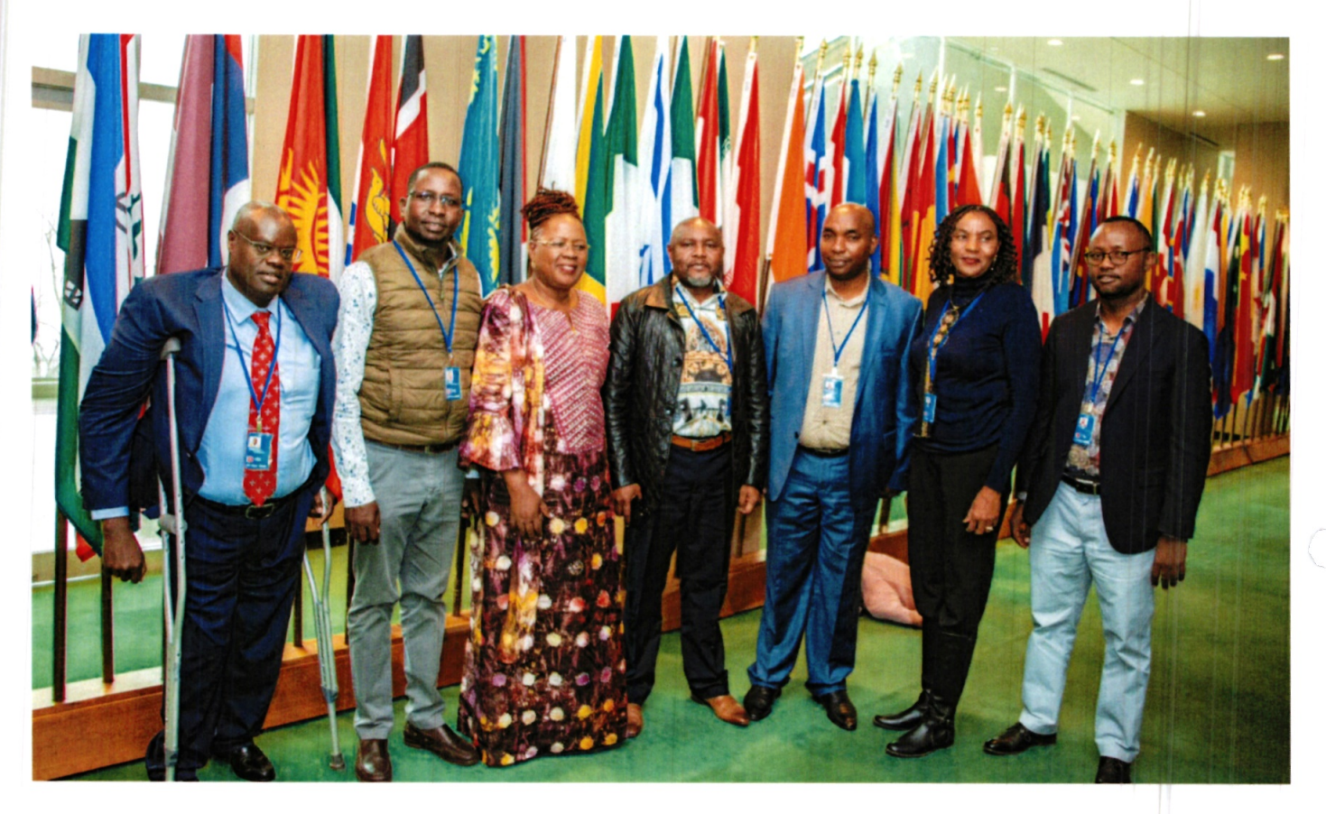
National Assembly Delegation with the Cabinet Secretary Ministry of Water, Sanitation and Irrigation at the UN headquarters New York;