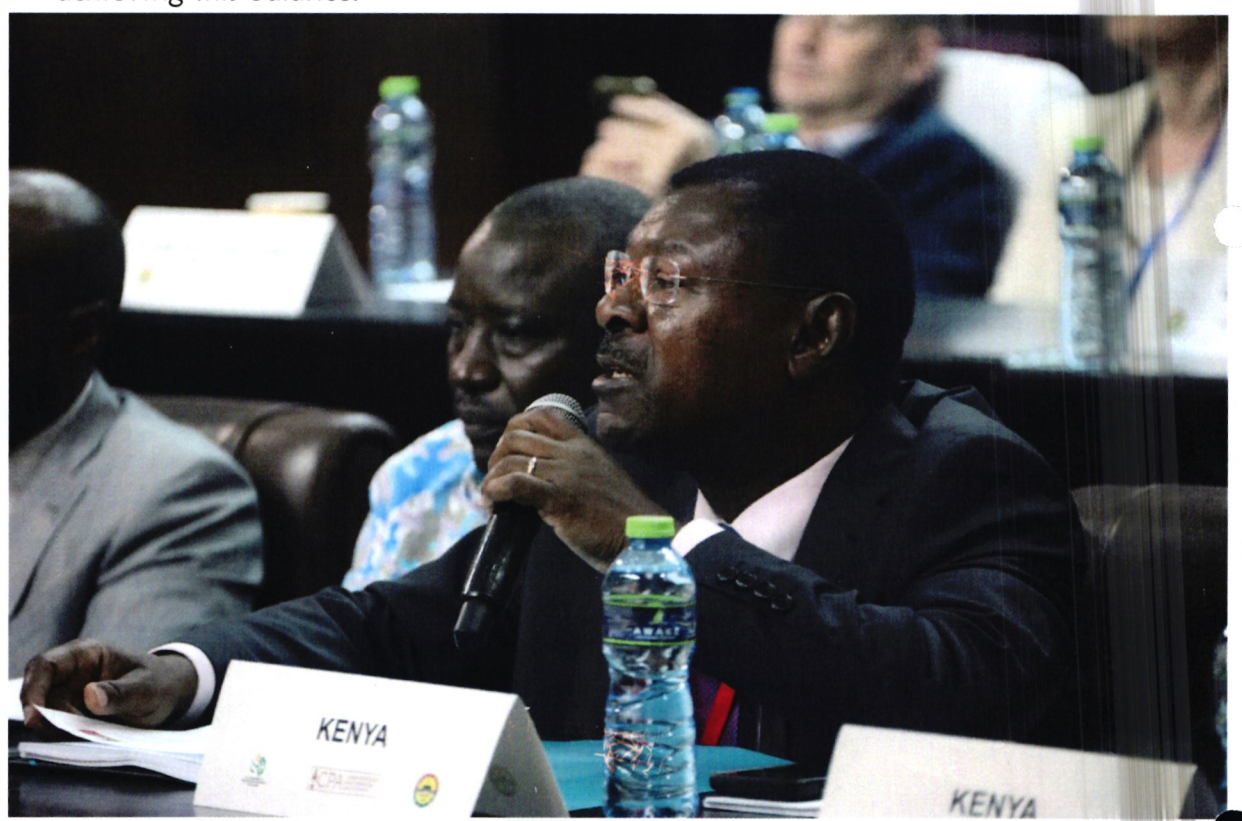
The Rt. (Dr.) Hon. Moses M. Wetang'ula, MP, Speaker of the National Assembly contributing to the debate on food sesucity and sustainability in the Commonwealth

iii. In his conctribution, the Rt. Hon. (Dr.) Moses M. Wetang'ula, EGH, MP, Speaker of the National Assembly stated that food security and sustainability is a pressing issue that requires concerted efforts and innovative strategies to address. The Speaker stated that the process of harvesting was integral to food security and sustainability. He noted that it was essential to strike a balance between meeting the immediate food needs of the people and safeguarding the resources and ecosystems that will continue to provide for those needs in the long term. He further noted that sustainable harvesting practices are key components of achieving this balance.