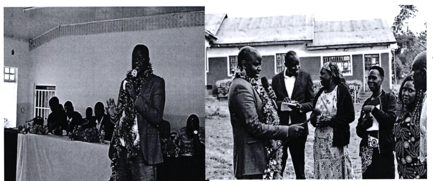
PUBLIC PARTICIPATION FOR KUINET/KAPSUSWA WARD HELD ON 10/01/2023 AT GREEN FIELDS PRIMARY SCHOOL.

The low absorption rate/expenditure was occasioned by delay in the release of the allocation table and subsequently delay in release of the funds to the before the closing of the financial year