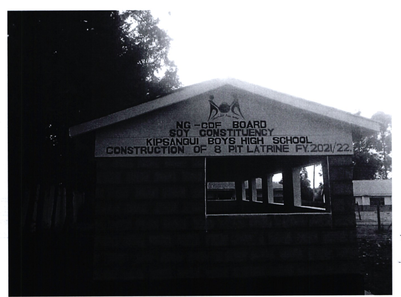
Kipsangui Boys High school Construction of eight door pit latrine