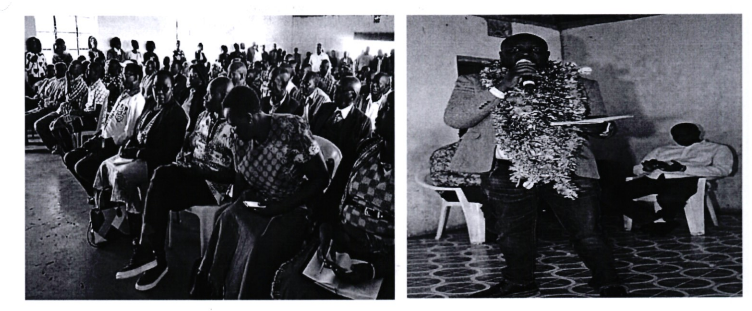
PUBLIC PARTICIPATION FOR KAPKURES WARD HELD ON 11/01/2023 AT ST. PETERS KAPKOREN SECONDARY SCHOOL