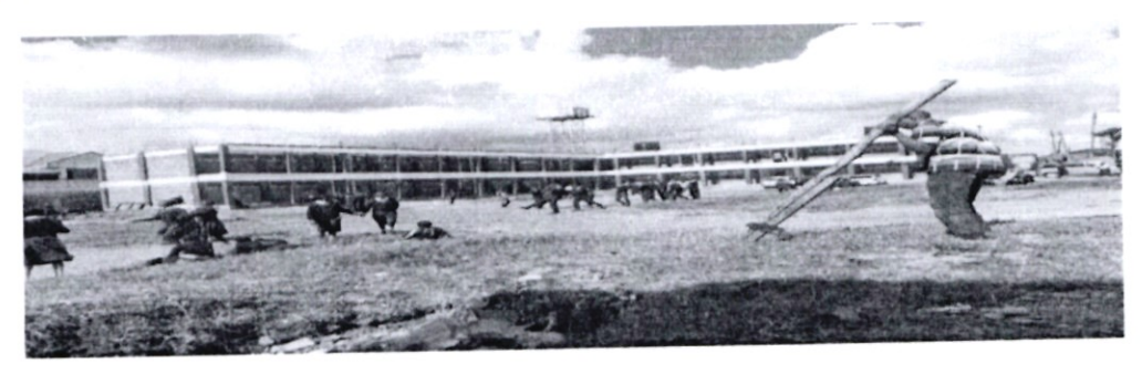
REUBEN SECONDARY SCHOOL

Once complete the benefits in the respective schools will be immense giving the learners a conducive environment for learning.