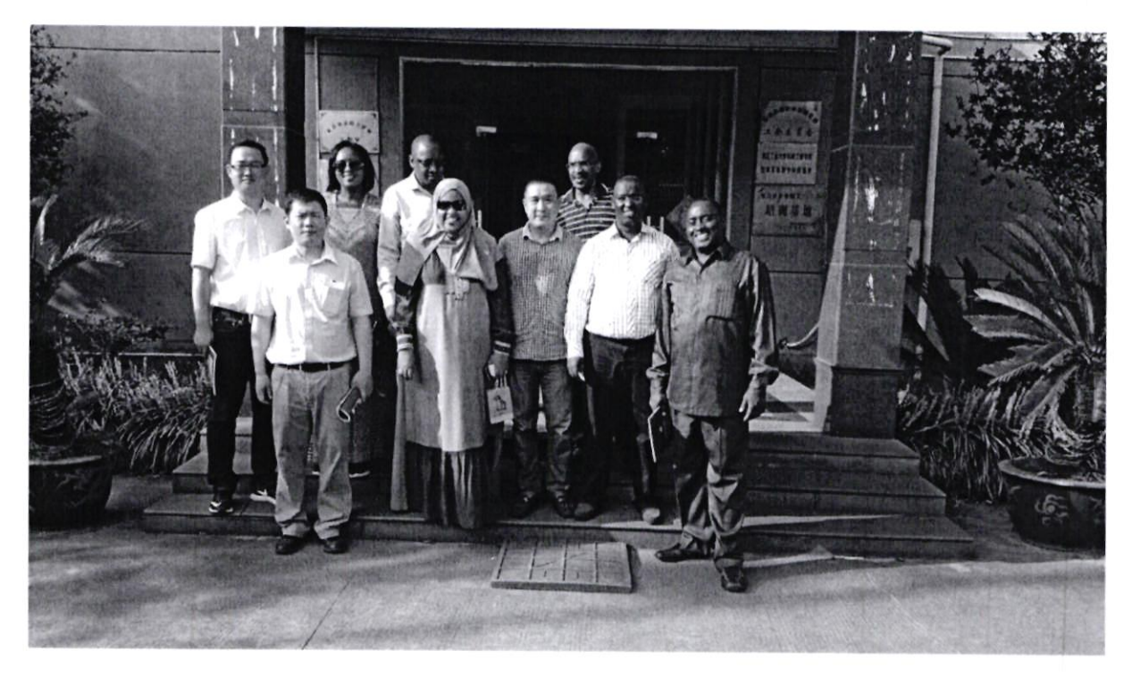
A photo of the Delegation outside a bamboo flooring tiles company