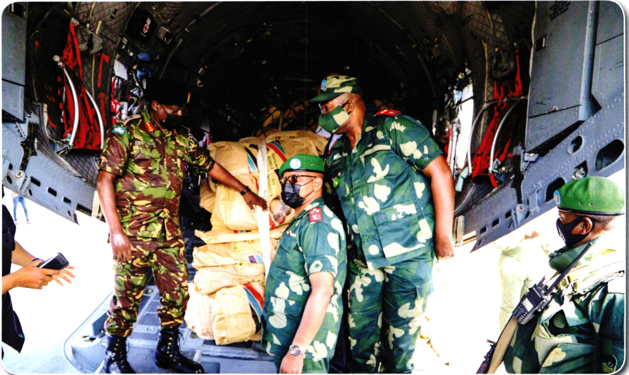
GOC East/Com Major General Ayub Matiiri delivers a consignment of relief food from the KDF following the eruption of Mount Nyiragongo in Goma, DR Congo on 8 June 2021.

3.13.3 Food Aid: On behalf of the Republic of Kenya, KDF delivered 24 tonnes of assorted medicine, dried food, meat and meat products in support of humanitarian effort in Goma, DRC.