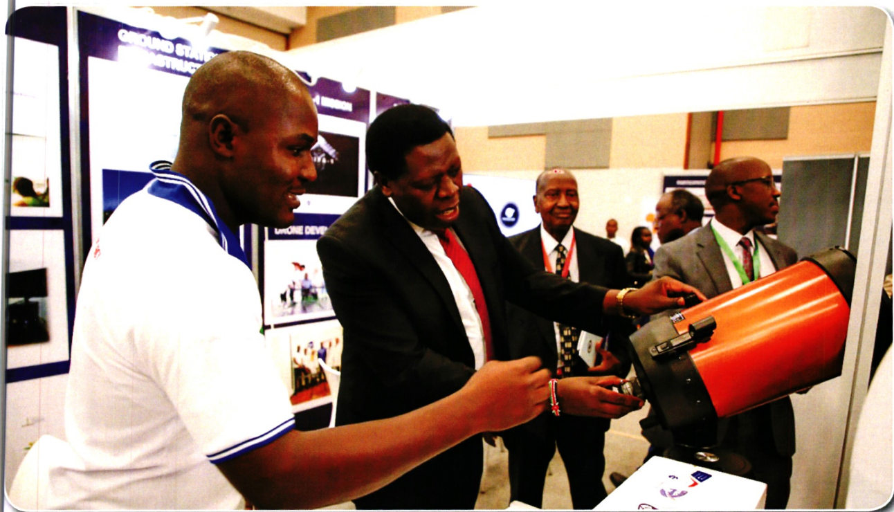
Defence CS Hon. Eugene Wamalwa tours an exhibition booth during the Kenya Space Agency (KSA) Expo and Conference held at Sarit Centre in Nairobi from 15 to 17 June 2022.

3.27.2 Kenya Shipyards Limited: Kenya Shipyards Limited (KSL) was established vide Executive Order CAB/GEN.3/1/1 (60) dated 14 August 2020 by the National Security Council to address operationalization requirements of the Kenya Navy and MDAs. The company utilized resources to generate revenue for the government by tapping into available local and regional market for construction, repair and maintenance of ships and provision of other maritime services.