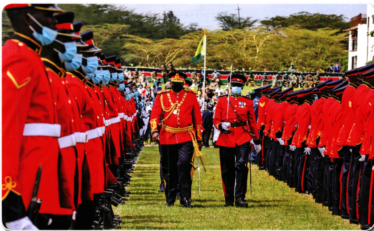
H.E. President Uhuru Kenyatta inspecting a Guard of Honour during Jamhuri Day Celebrations at Uhuru Gardens National Monument and Museum on 12 December 2021

3.12 In addition, MoD performed ceremonial duties which included National Days' celebration parades, reception and provision of security to visiting dignitaries and Heads of State and/or Government.