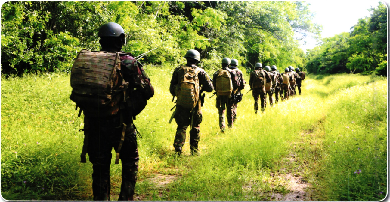
KDF soldiers on patrol during Exercise Linda Bahari in Boni, Lamu on 15 July 2021

3.2 Performed its core mandate of defence and protection of the sovereignty and territorial integrity of the Republic.