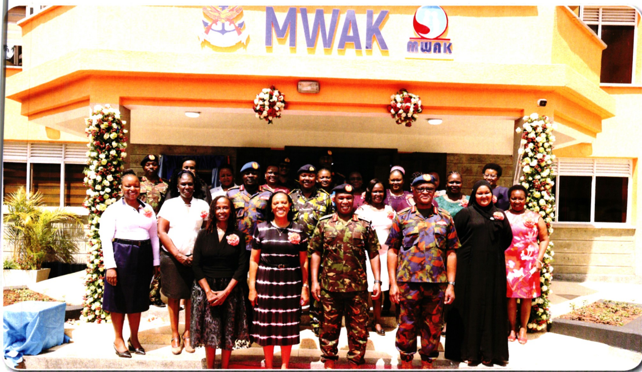
Chief of Defence Forces General Robert Kibochi and his Vice, Lieutenant General Francis Ogolla pose for a photo with MWAK Members during the inauguration of MWAK Offices on 17 March 2022.

3.22.2 Widows, Orphans and Dependants Policy: This regulation acknowledges the increase in the numbers of vulnerable groups including widows and orphans arising from the recent deployments of KDF personnel among other factors. The regulation established the KDF welfare centres and the launch of the Military Wives Association of Kenya (MWAK) whose main role is to coordinate all issues relating to family welfare covering spouses, widows, orphans and dependants of KDF personnel.