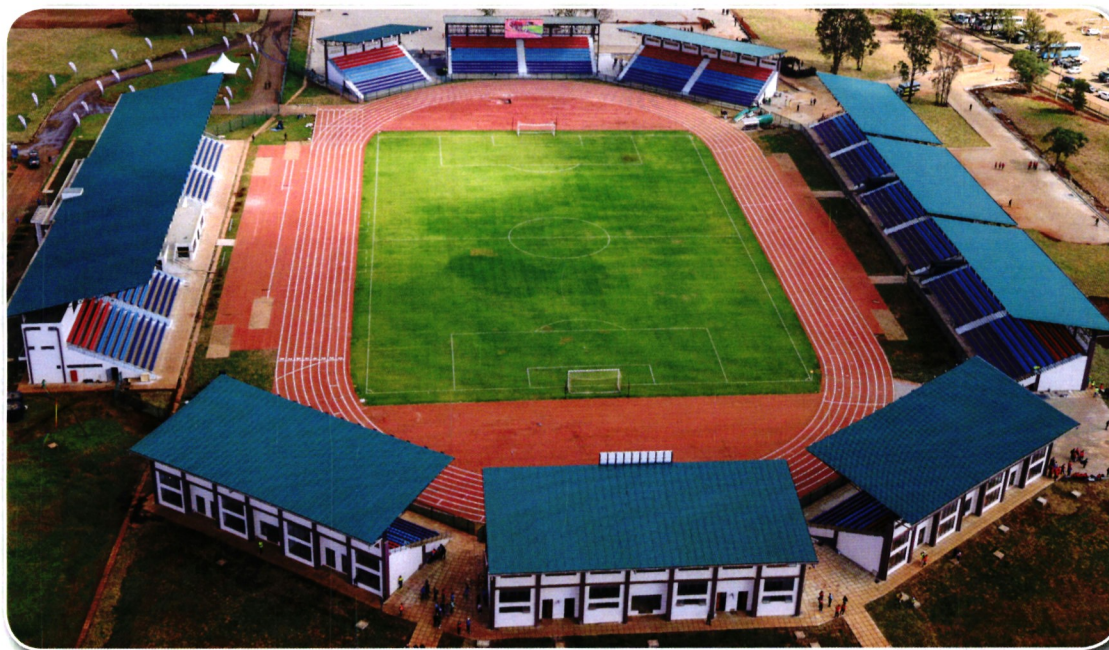
The newly constructed Ulinzi Sports Complex-Lang'ata as at 30th June 2022