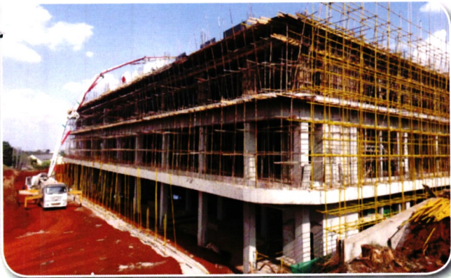
FRRH - Ongoing construction of Accident and Emergency Block at Kabete as at 30 June 2022