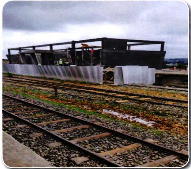
Ongoing Ol Kalou Railway Station