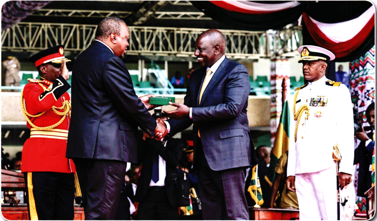
H.E the President and Commander in Chief of the Defence Forces, Dr. William Ruto receives instruments of power from his predecessor, H.E Uhuru Kenyatta during the inauguration ceremony on 13/9/2022 at the Moi International Sports Centre, Kasarani.