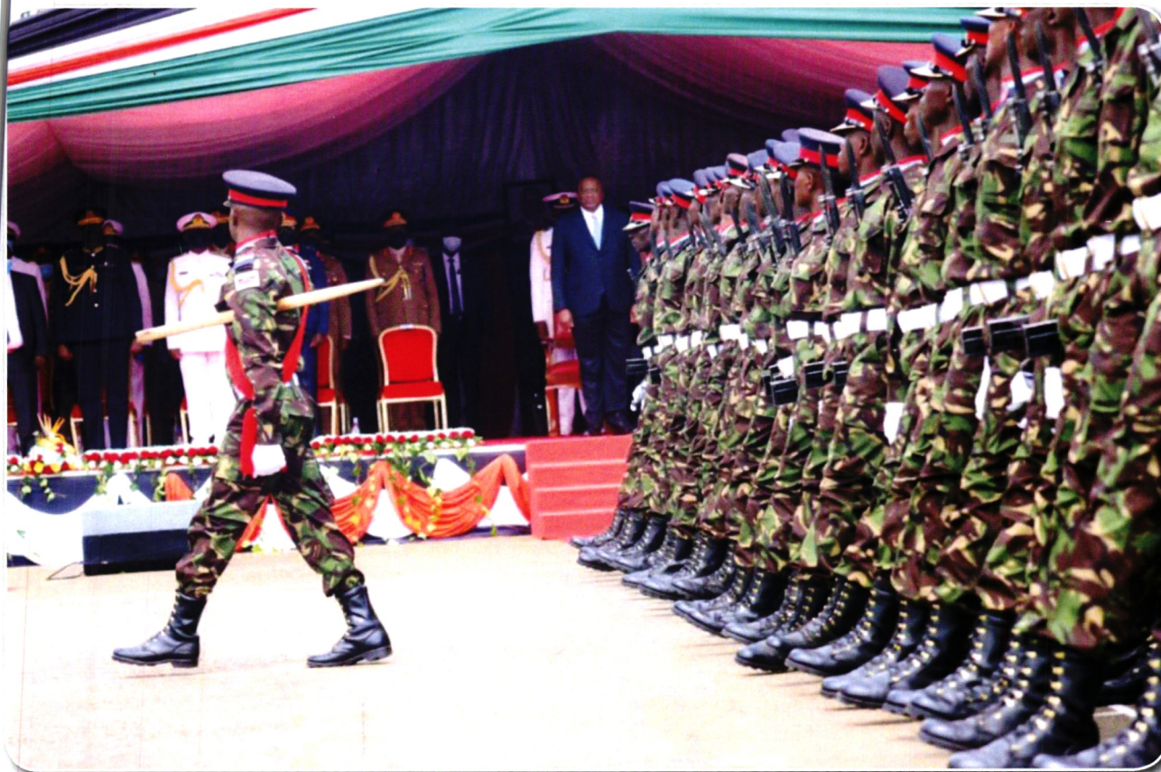
Recruits march past H.E Uhuru Kenyatta, the President of the Republic of Kenya and the Commander-in-Chief of the Kenya Defence Forces during a Pass-Out Parade at the Recruits Training School (RTS) on 5 November 2021.

4.6 Human Resource Capacity Gaps: Currently, the civilian in-post is approximately two thirds of the authorised establishment and retention of specialized staff remains a challenge. Despite this, KDF recruited personnel for various cadres and expanded their mandate. There's, therefore, a need for the Ministry to regularly recruit civilian staff so as to keep the civilian recruitment in tandem with the KDF recruitment.