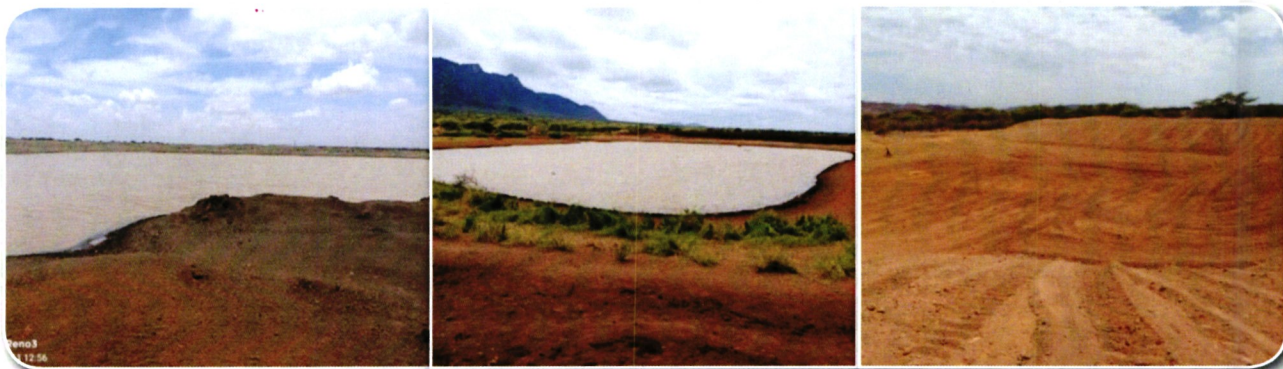
Kirimon Water Pan Samburu County

3.13.1 Water Provision: The Ministry sank community boreholes at Mukutani in Baringo County and assisted locals to harvest rain water through construction of water pans, dams, shallow wells and underground water collection tanks at Kirimoni in Samburu, Kapedo in Turkana and Idido & Demo in Marsabit. These projects have benefitted the locals by supplying water for human & livestock needs and for small-scale farming and thereby reducing resource-based conflicts in the arid and semi-arid areas.