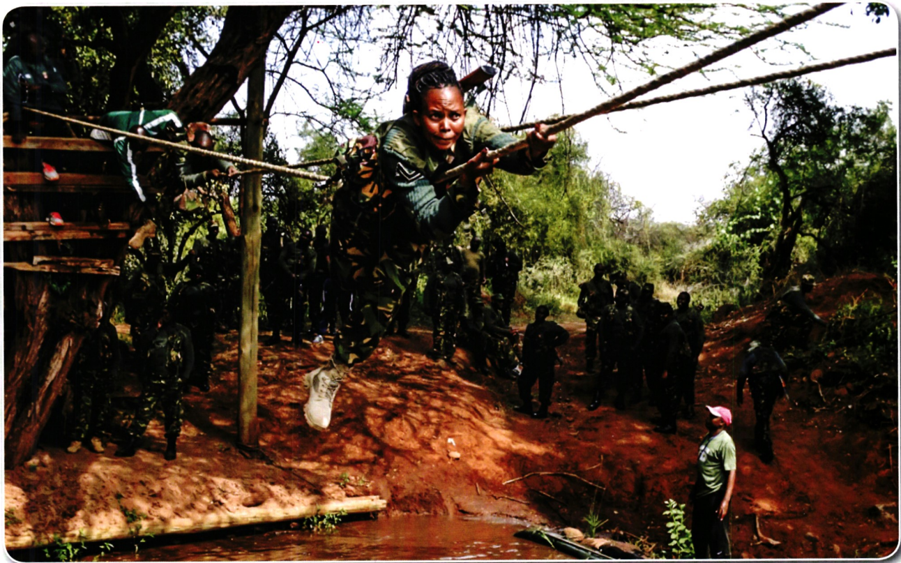
Soldiers undergo training during a Platoon Sergeants' Course at the School of Infantry in Isiolo on 11 September 2021

3.5 During the period, operational equipment readiness - which includes Infantry, Armour, Artillery, Engineers, Communications, Air and Naval systems - stood at 72.09% through acquisition of new systems and repair of existing ones.