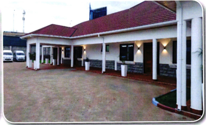
FRRH VIP Lounge

3.7 The hospitals were equipped with state-of-the-art machines such as CT scan, X-Ray, dialysis, optometry machines and oxygen plants in Eldoret and Isiolo. MoD also recruited 712 medical personnel who were deployed to Defence Forces Memorial Hospital and Regional Hospitals. The Construction of Forces Referral & Research Hospital (FRRH) - Level VI at Kabete was 10% complete as at 30th June 2022. These developments have improved accessibility to healthcare by our soldiers and their dependants.