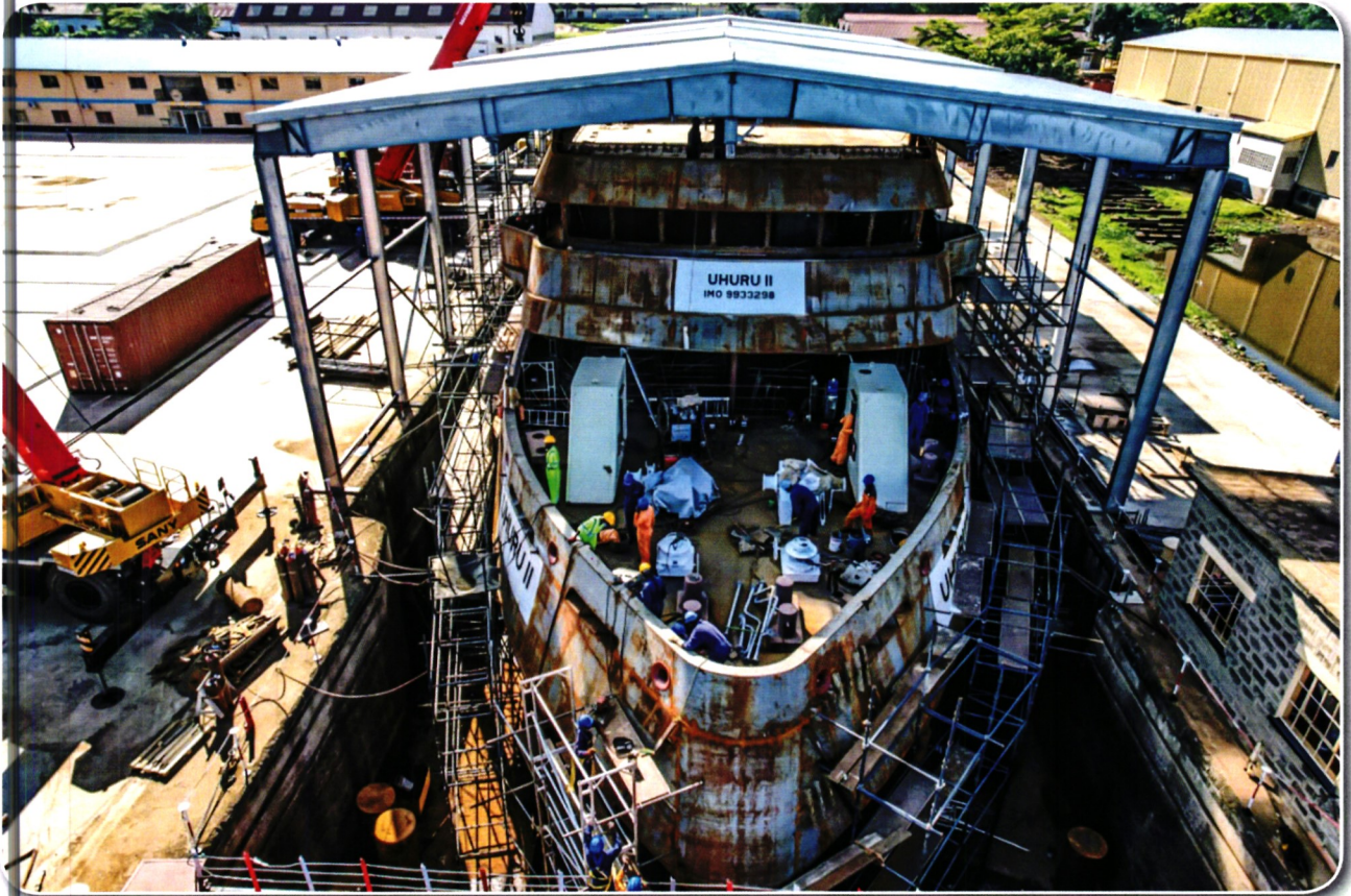
Ongoing construction of the first Kenyan-made Ship, MV Uhuru II, at the Kisumu Shipyard as at 30th June 2022