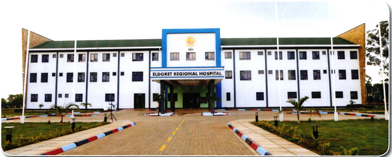
Front view of the completed Eldoret Regional Hospital (ERH) at Moi Barracks as at 30 June 2022

3.6 Development of regional hospitals to cater for the needs of KDF personnel and their families is ongoing. MoD constructed and equipped regional hospitals in Nairobi, Isiolo, Eldoret and Nakuru.