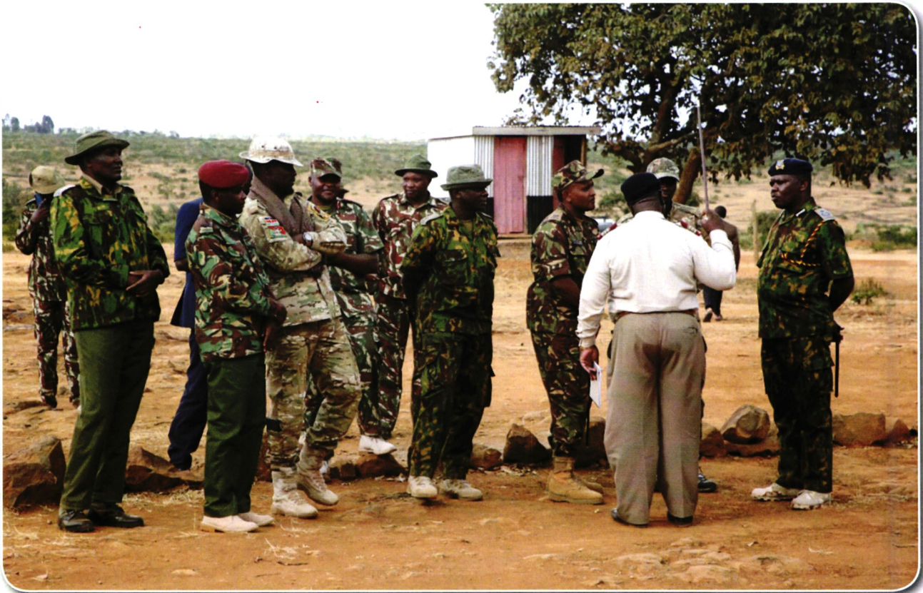
A multi-agency security team during Operation Rejeshu Utulivu in Laikipia on 20 November 2021

3.9 The Ministry, on multi-agency approach to national security, continued to collaborate with Ministries, Departments and Agencies (MDAs) and other stakeholders to achieve its mandate. In this regard, therefore, KDF collaborated with the Ministry of Interior and Coordination of National Government in conducting close operations such as Operation Amani Boni (OAB) in Lamu and Operation Rejeshu Utulivu at Nature Conservancy in Laikipia resulting in major outcomes that had a positive impact on national security. Other operations included manning of multi-agency roadblocks in Isiolo, Garissa and Kilifi Counties, among other areas.