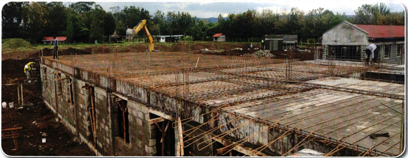
Ongoing construction of Lanet Regional Hospital at Lanet Barracks in Nakuru as at 30 June 2022