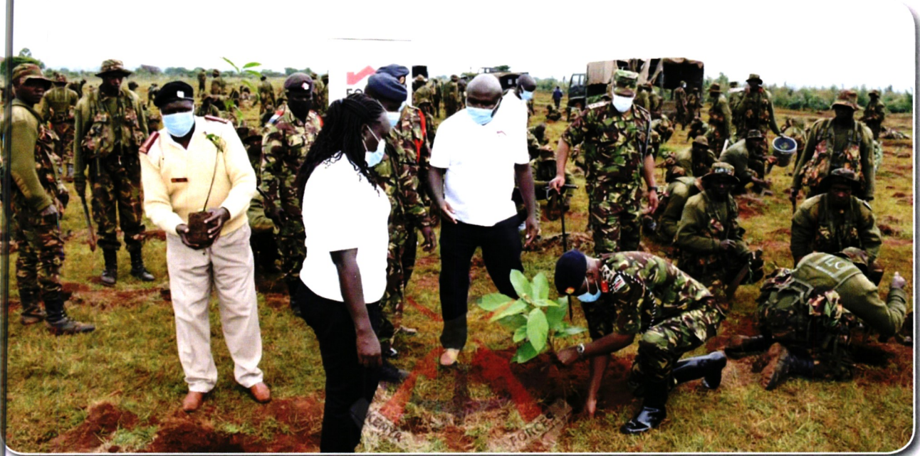
KDF personnel in partnership with Equity Bank plant trees at Recruits Training School (RTS) in Eldoret on 1 July 2021.

3.16 Research and Development: R & D is an important aspect of technological advancement that seeks to improve capacity for technological innovation, self-reliance and quality of military systems.