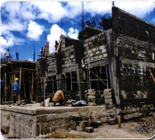
Ongoing Nyahururu Railway Station