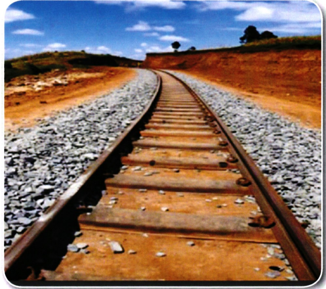
Rehabilitation of the 37 Km Elburgon MGR (Before and After)